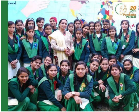
46 GIRLS WENT FOR HIGHER EDUCATION

Super heroes of PPES- 46 girls went for Higher Education, proud moment for PPES !!!