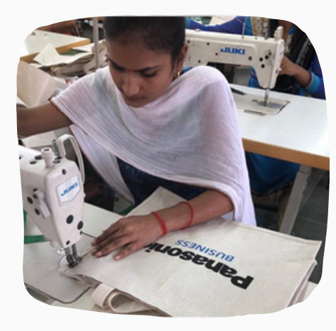
Currently, In-House Production 40 operators from 17 villages

The economic empowerment wing of PPES, IVillage creates gainful livelihood opportunities for rural girls and women. Through this, now we have ventured into making range of user-friendly "sustainable bags" to ensure the economic development of the women we are working with.