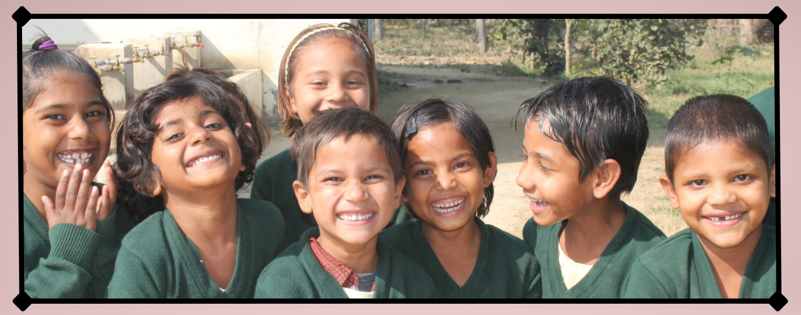
Creating a Lifetime of Smiles