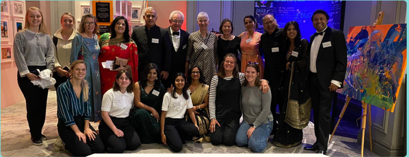
PPES team at Asian Achievers Awards, UK