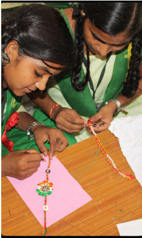
Rakhi Competition Handmade Rakhi's and cards prepared by PPES girls.