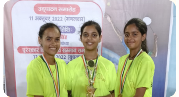
Gallery of our girls participating in various sports during the quarter.