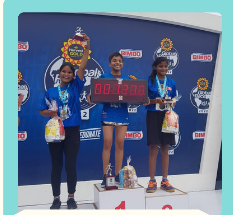
PPES girls at Harvest Gold Global Race