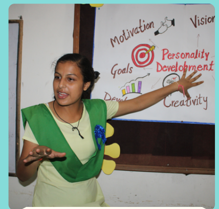
Aspirational Learning Club Class