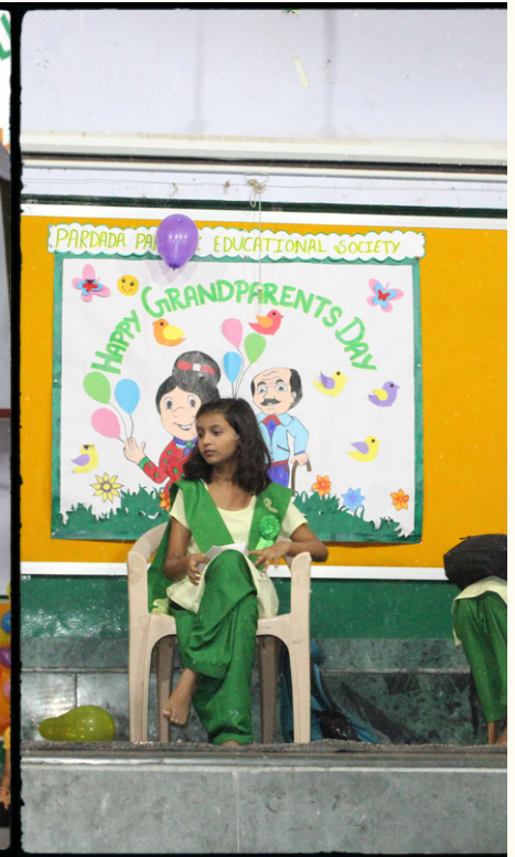
Grandparents Day To appreciate and show gratitude to our ancestors, PPES celebrated Grandparents Day.