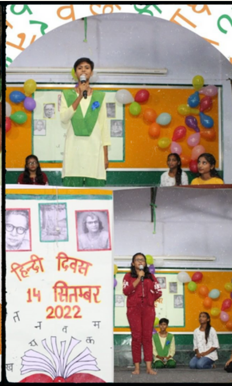
Hindi Diwas To celebrate the Hindi language, Hindi Diwas was celebrated at PPES.