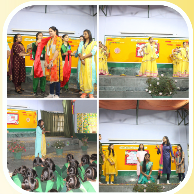
Women's Day Celebrations