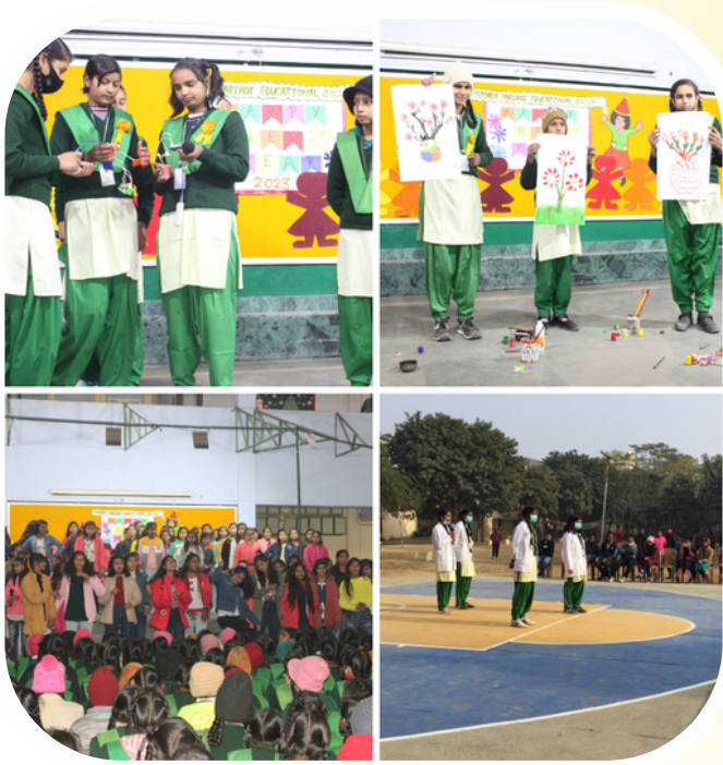
New Year Celebrations