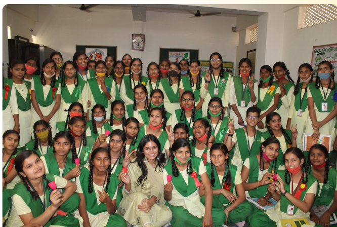
Menstrual Hygiene Session