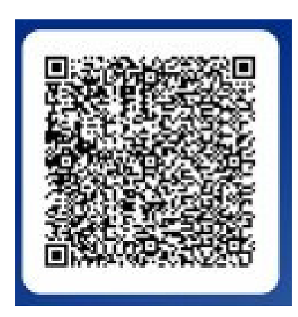
To sponsor a child, Scan the QR code