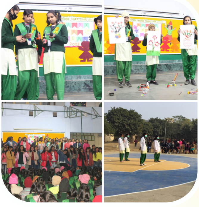
New Year Celebrations