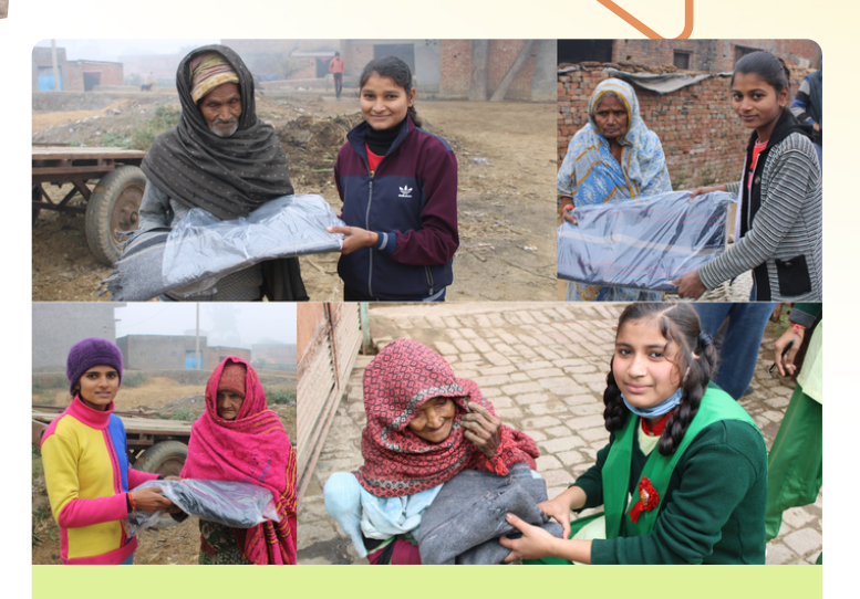
Blanket Distribution Drive

186 solar lanterns were distributed to the PPES girls. Girls found them very useful, especially during the long hours of power cuts at home.